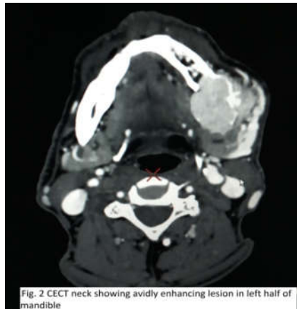
Fig. 2 CECT neck showing avidly enhancing lesion in left half of mandible