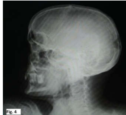
Fig. 4 X RAY SKULL LATERAL VIEW: Lytic lesion in occipital region.

Ultrasound guided Fine needle aspiration cytology (FNAC) was performed from left mandibular lesion as well as lesion in left lobe of thyroid. Microscopic examination revealed features of follicular thyroid carcinoma (FTC) at both sites consistent with primary FTC with metastatic mandibular lesion. FNAC revealed - moderate cellularity with large number of follicular epithelial cells present predominantly in micro-follicles, few in large groups and crowded in syncytial sheets, few follicular cells show intra nuclear inclusion. Moderate degree of anisonucleosis, prominence of nuclei and irregularity of nuclear margin suggestive of follicular metastasis to the mandible and follicular carcinoma from left lobe of thyroid