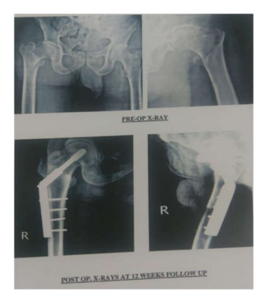
Table 3 Pre op and Post op x-ray with PFN