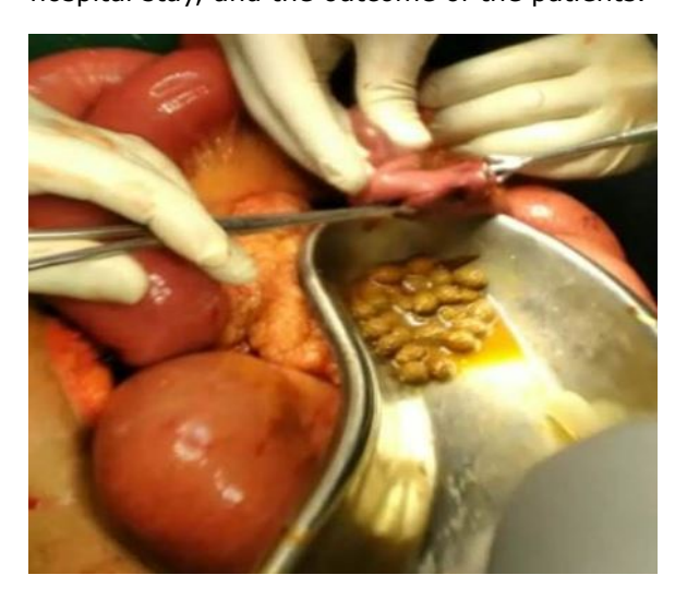
Figure-4 obstruction secondary to Indian Plum Seeds

Data Collection Procedure: - included- a detailed record of the patient's history, physical examination, and necessary investigations like baseline, X-Ray abdomen erect and supine in all cases, ultrasound abdomen, CT Abdomen were recorded based on the requirement for each subject. A proforma was recorded of each patient with age, sex, symptom duration, past surgical & medical history, diagnostic workup, etiology of obstruction, the time between arrival and operation, operative information, comorbid factors, morbidity and mortality, length of hospital stay, and the outcome of the patients.