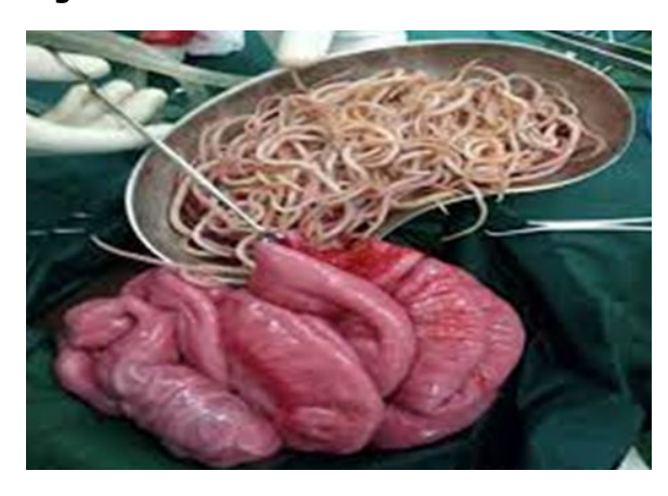
Figure 8. Foreign Body Obstruction-Worm Infestation (Ascaris L.)

Post–Operative Complications: Out of patients who had postoperative complications, the most common was fever in 6 patients (30%), followed by Pulmonary Complications in 20% (4)Patients and wound gaping in 15% (3) patients. Prolonged ileus was seen in 10% (2) patients. More severe complications like burst abdomen occurred in 5% (1) patients, faecal fistula in 5% (1) patients. It found that patients with tuberculous obstruction are more prone to complications.