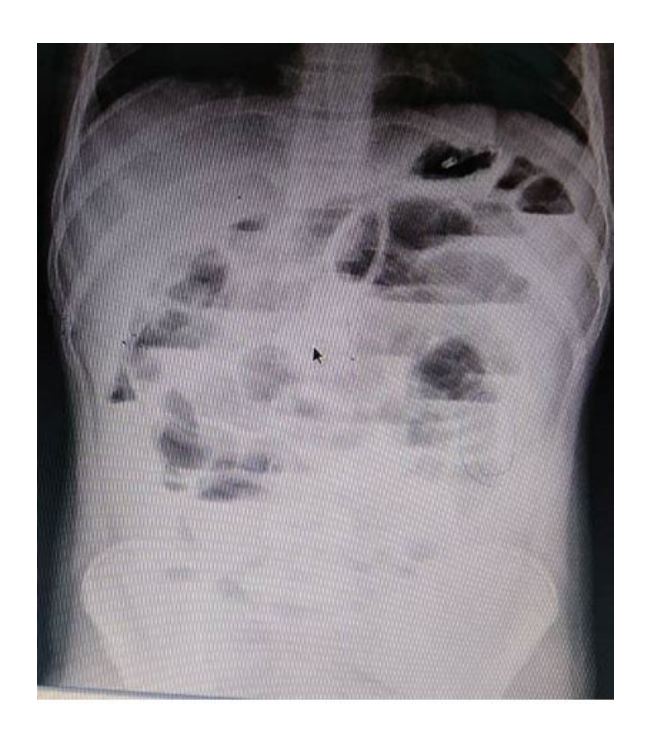
Figure 9: Multiple Air Fluid Levels seen on Xray Abdomen Erect in a patient with Small Bowel obstruction

Mortality: Out of 20 patients, death occurred in 4 patients (20%), three patients were of Tuberculous Abdomen (15%), one was of Transverse Colon volvulus (5%). All four patients died due to septicaemia, of which one also developed Pulmonary complications (Pleural effusion).