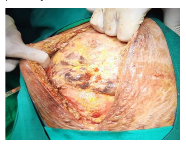
Figure-6 Coccon Abdomen in A Case of Abdominal Koch's

Operative Management: All patients were managed with Emergency exploratory Laparotomy. Enterotomy was done in 5 patients (25%). Second most common management done was Resection anastomosis (4 cases-20%) followed by Reduction and Repair of Hernia and Hemicolectomy done in 3 patients each(15%) and ileostomy done in 2 patients(10%). Colostomy done in 1 patient(5%) (16.67%) followed by derotation of volvulus in 1 patient(5%) and Sigmoidectomy in 1 (5%). Gangrenous changes were seen in 5 cases (25%) presenting with obstruction due to various causes.