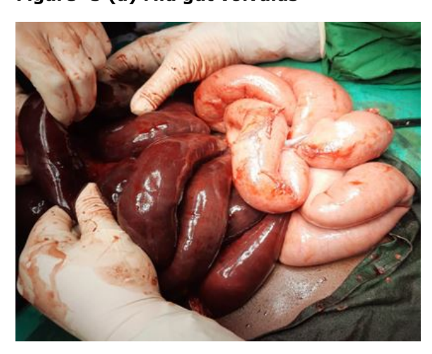
Figure -5 (b) Midgut Volvulus with Gangrenous Ileal segment

SEX : Out of the 20 patients, 60% (12) patients were Males, and 40% (08) patients were females. Male to Female ratio is 1.5: 1