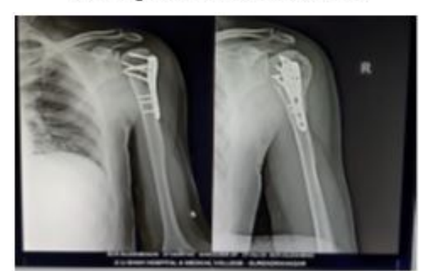
Post-op on final follow up