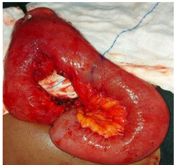
Figure 2: Segment of bowel containing Meckel's Diverticulum being resected.

The appendix was inflamed with pus and omental adhesions. A sessile inflamed Meckel's diverticulum was found 50 cms proximal to the ileocecal junction with a mesodiverticular band extending to its tip (Figure 1). Resection was planned as the diverticulum bled on touch. He underwent laparoscopic appendicectomy with segmental ileal resection via extended sub umbilical incision with end to end anastomosis in 2 layers (Figure 2).