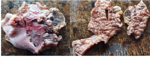
Figure 3: Gross specimen of resected Meckel's Diverticulum.

Case 2 - 24-year-old lady, sister of the previously mentioned patient, presented to the emergency room with abdominal pain and nausea of 1-day duration. On physical examination, she was hemodynamically stable with no pallor. The abdomen was soft with tenderness in the right iliac fossa. Contrast-enhanced CT scan of the abdomen revealed mildly dilated appendix 7mm in diameter, periappendiceal fat stranding and peritoneal thickening with few prominent mesenteric lymph nodes and left ovarian dermoid cyst. She was posted for emergency diagnostic laparoscopy under general anesthesia. 10 mm sub umbilical, 5mm suprapubic and 5mm left iliac fossa ports were used. The open technique of pneumoperitoneum was done. The appendix was inflamed with minimal pus in the pelvis. Meckel's diverticulum was noted 40 cms proximal to the ileocecal junction with a mesodiverticular band entering its tip (Figure 4). She underwent laparoscopic appendectomy, segmental ileal resection with end to end anastomosis in 2 layers along with excision of the ovarian dermoid cyst via extended sub umbilical incision.