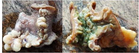
Figure 5: Gross specimen of Meckel's Diverticulum.

(Figure5). Specimen of the left ovarian cystic mass showed cyst wall lined by stratified squamous epithelium with adnexal structures. Both patients were followed up in the outpatient department after 2 weeks and noted to be in good health with no postoperative complications.