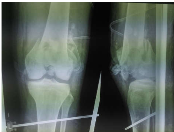
Figure-1: Preoperative x ray