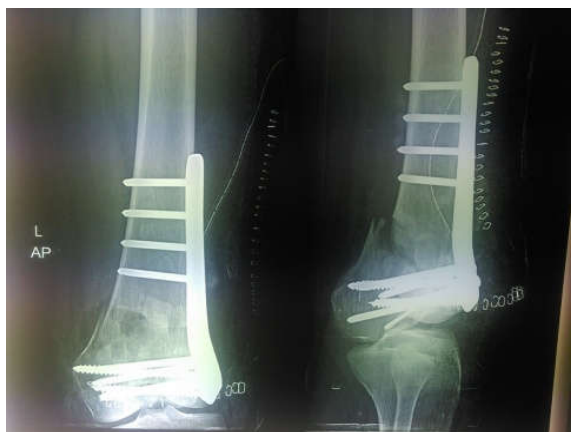
Figure 2: immediate post operative x ray