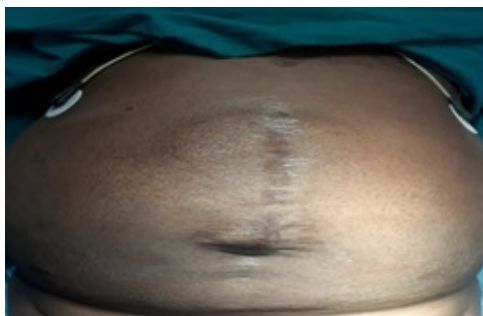
Fig-1: Incisional hernia.

Followed up for 6 months period were done in all the 32 cases and no recurrence was noted