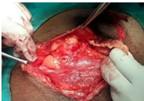
Fig-2: After reduction of the hernial sac.