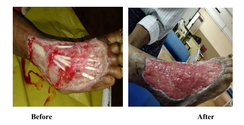
Fig.-03: Wound before and after treated with topical sucralfate dressing