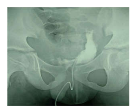
Fig-1: RGU S/O Urinary Extravasation

Traditional management of pelvic fracture urethral injury (PFUI) is placement of a suprapubic tube (SPT) and delayed urethroplasty to reconnect the ruptured urethra another approach is Primary endoscopic re-alignment for hemodynamically stable patients or advancing a urinary catheter across the posterior urethral ruptures and third approach is primary surgical repair over catheter in early period [1].