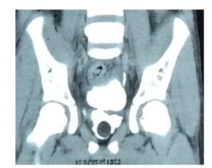
Fig-2: CECT S/O Urinoma around Bladder Neck