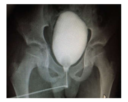
Fig-4: Post Operative Normal Cystogram